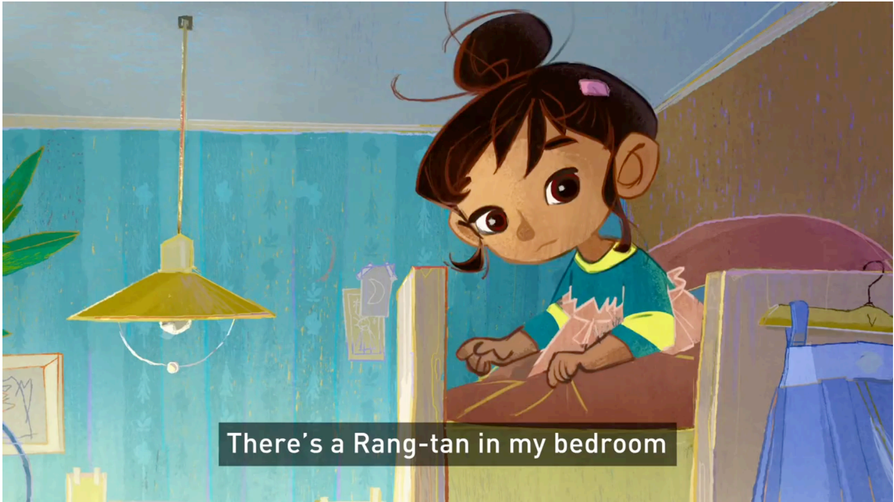
There's a Rang-tan in my bedroom